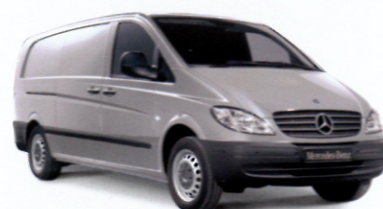
brilliant silver metallic*