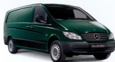
andradite green metallic*