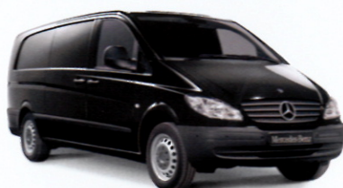
obsidian black metallic*