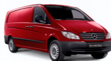
amber red metallic*