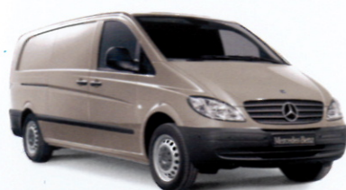
cubanite silver metallic*