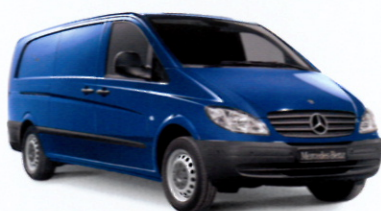
jasper blue metallic*